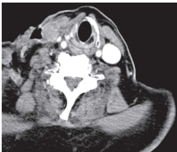
FIGURE 2. Neck CT revealing swollen lymph nodes with central melting and the abscess, surrounding the patient's right jugular vein, which appeared fine-spun (thin with decreased inner diameter) with a lack of repletion after contrast agent infusion, an image that set the suspicion of tuberculous lymphadenitis and of right jugular vein thrombosis.

stopped and standard anti-tuberculosis treatment (Isoniazid, Rifampicin, Pyrazinamide and Ethambutol) was initiated. A chest CT was also performed, which did not reveal any signs of active or past pulmonary tuberculosis. Furthermore, the patient was not aware of coming in close contact with any person having pulmonary tuberculosis in the past, while before his BCG immunotherapy, he was subjected to Mantoux test, which was negative. His close relatives were also checked with Mantoux test and were all negative. Because of his recent history, BCG immunotherapy was considered to be responsible for the patient's tuberculous lymphadenitis. Unfortunately molecular confirmation was not possible. The culture of the last pus sample also came back positive for the Mycobacterium Tuberculosis complex six weeks later. Although the subtype of the Mycobacterium could not be identified, the strain was resistant to Pyrazinamide.